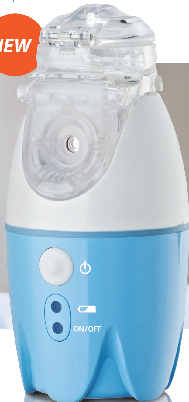
model NEPLUS (NE-SM1)